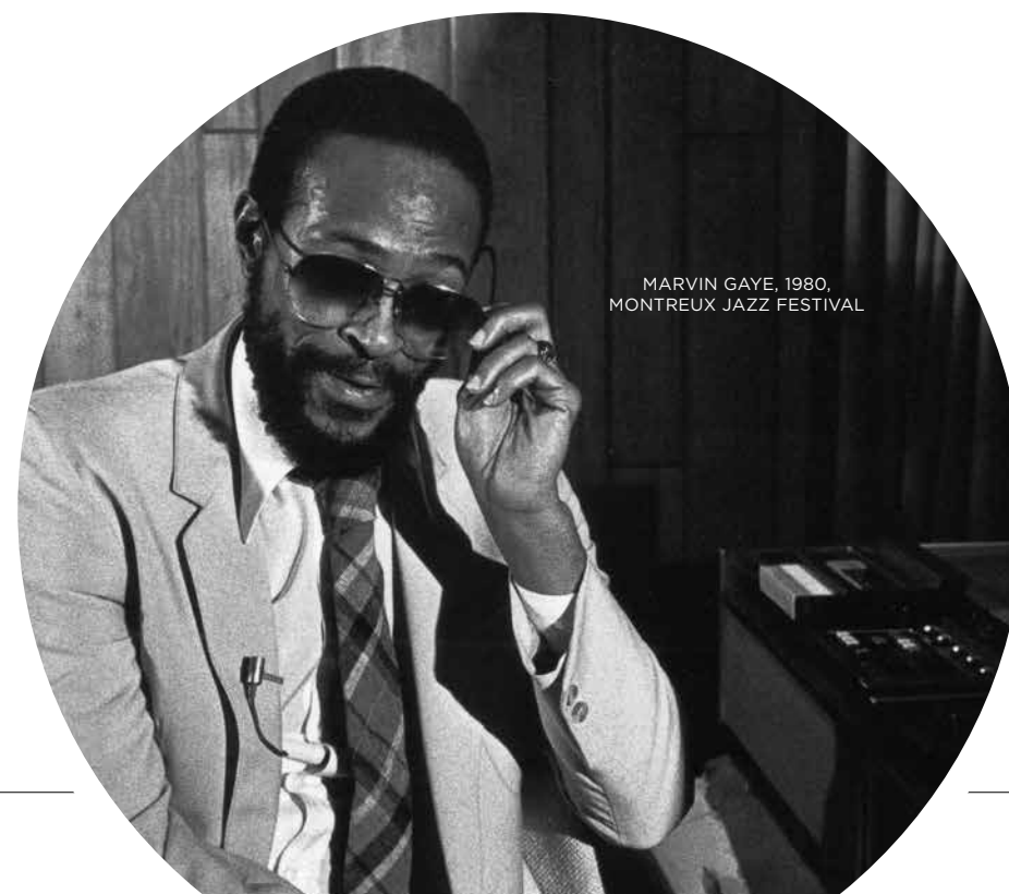
MARVIN GAYE, 1980, MONTREUX JAZZ FESTIVAL