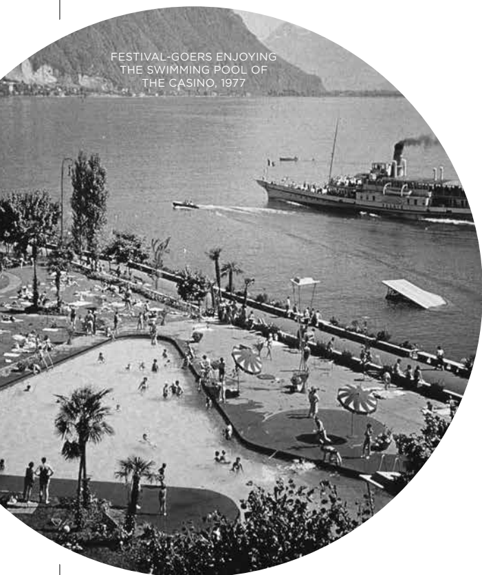
FESTIVAL-GOERS ENJOYING THE SWIMMING POOL OF THE CASINO, 1977