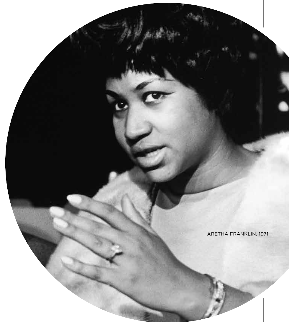
ARETHA FRANKLIN, 1971

Unsere Mitarbeiter beantworten gerne Ihre Fragen zu Allergenen in unseren Produkten. Spuren von Allergenen Stoffen können aufgrund handwerklicher Herstellung trotz grösster Sorgfalt nicht vollständig ausgeschlossen werden.