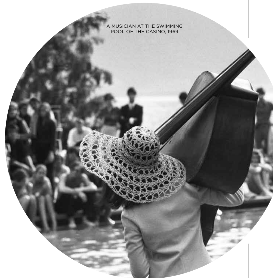
A MUSICIAN AT THE SWIMMING POOL OF THE CASINO, 1969