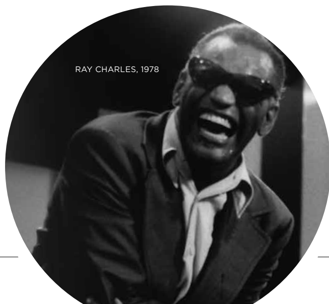
RAY CHARLES, 1978