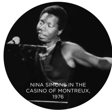
NINA SIMONE IN THE CASINO OF MONTREUX, 1976