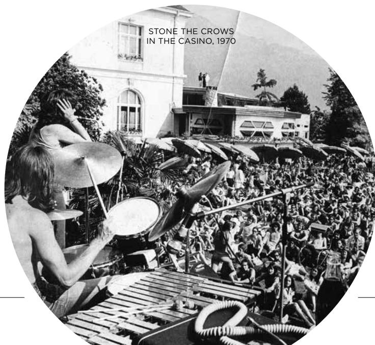
STONE THE CROWS IN THE CASINO, 1970

Serviert mit Pommes Frites Served with French fries