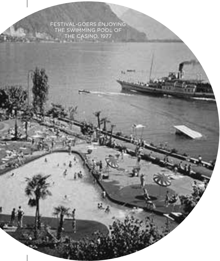
FESTIVAL-GOERS ENJOYING THE SWIMMING POOL OF THE CASINO, 1977