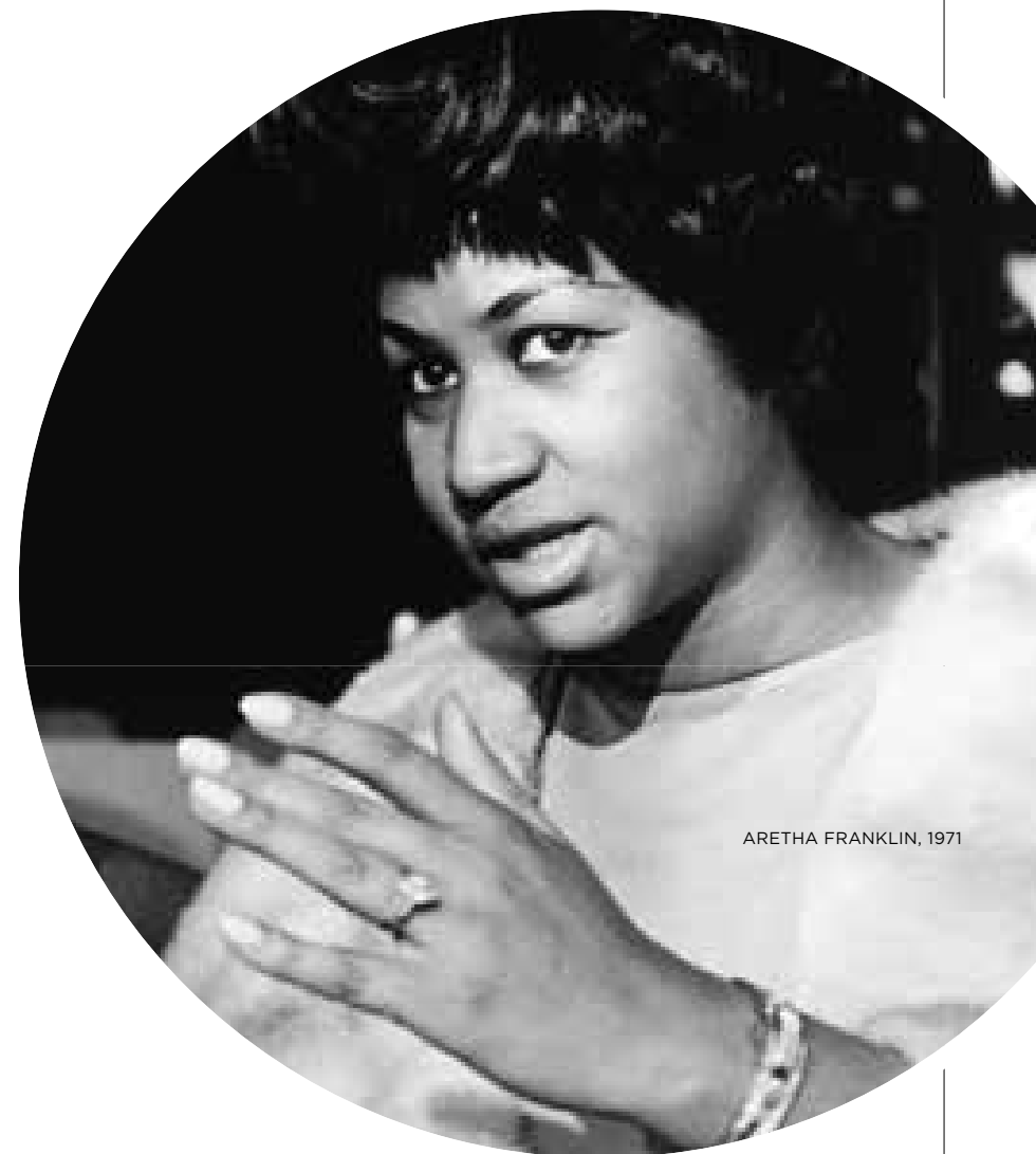
ARETHA FRANKLIN, 1971

Unsere Mitarbeiter beantworten gerne Ihre Fragen zu Allergenen in unseren Produkten. Spuren von Allergenen Stoffen können aufgrund handwerklicher Herstellung trotz grösster Sorgfalt nicht vollständig ausgeschlossen werden.