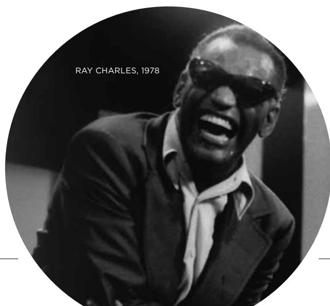
RAY CHARLES, 1978