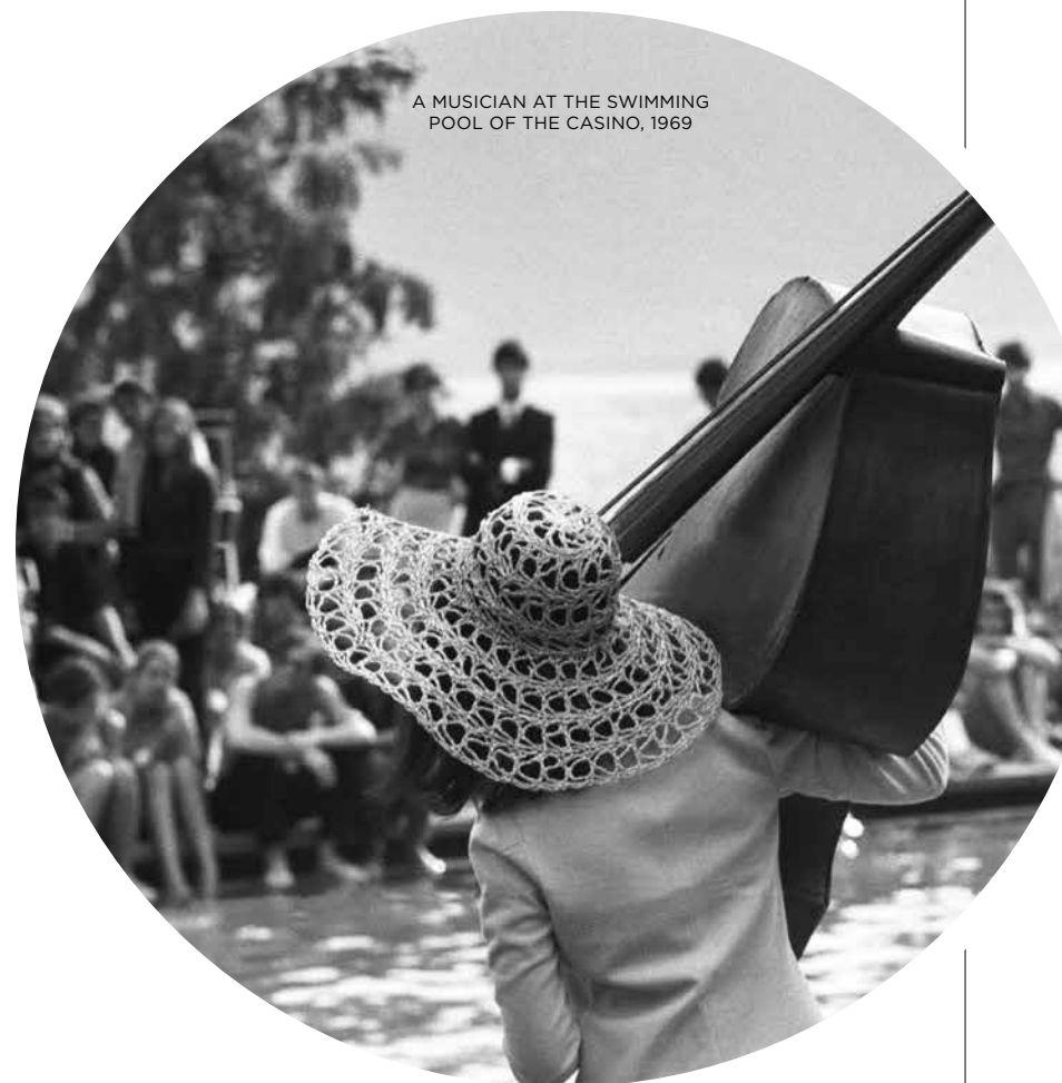
A MUSICIAN AT THE SWIMMING POOL OF THE CASINO, 1969