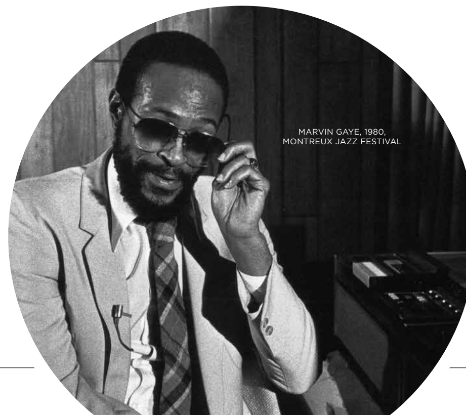
MARVIN GAYE, 1980, MONTREUX JAZZ FESTIVAL